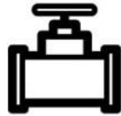
Sanitary Sewer/ Wastewater