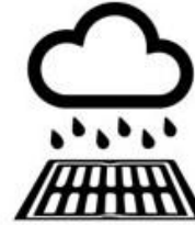
Storm Drainage and Watershed

Please check the type of capital project for your suggested idea (if you are not sure, use the "I don't know" option below)*