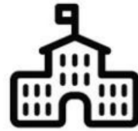
Buildings and Structures