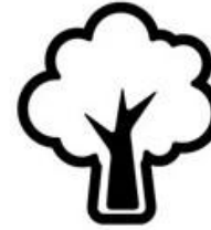
Parks and Open Spaces